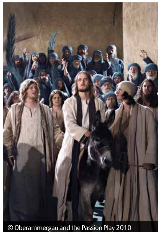
© Oberammergau and the Passion Play 2010

This is a provisional itinerary. Tour details currently subject to change.