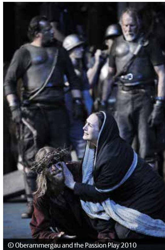
© Oberammergau and the Passion Play 2010

This is a provisional itinerary. Tour details currently subject to change.