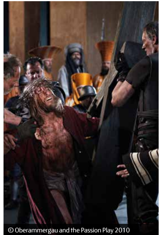
© Oberammergau and the Passion Play 2010

This is a provisional itinerary. Tour details currently subject to change.