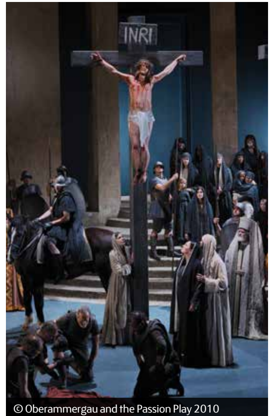
© Oberammergau and the Passion Play 2010

This is a provisional itinerary. Tour details currently subject to change.