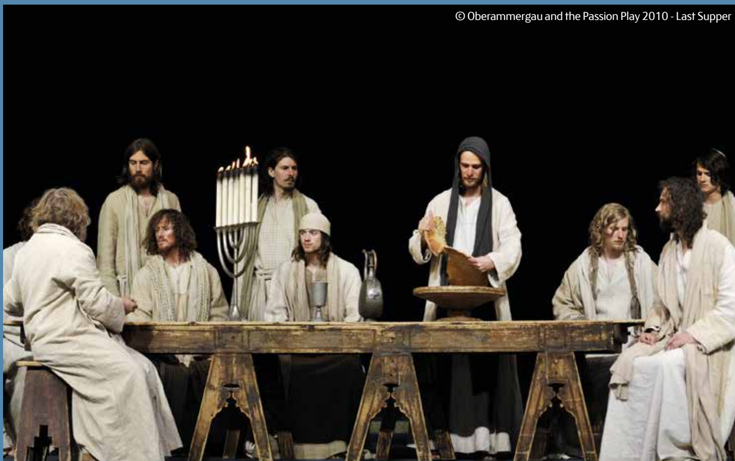
© Oberammergau and the Passion Play 2010 - Last Supper

Space is limited! Reserve your place today