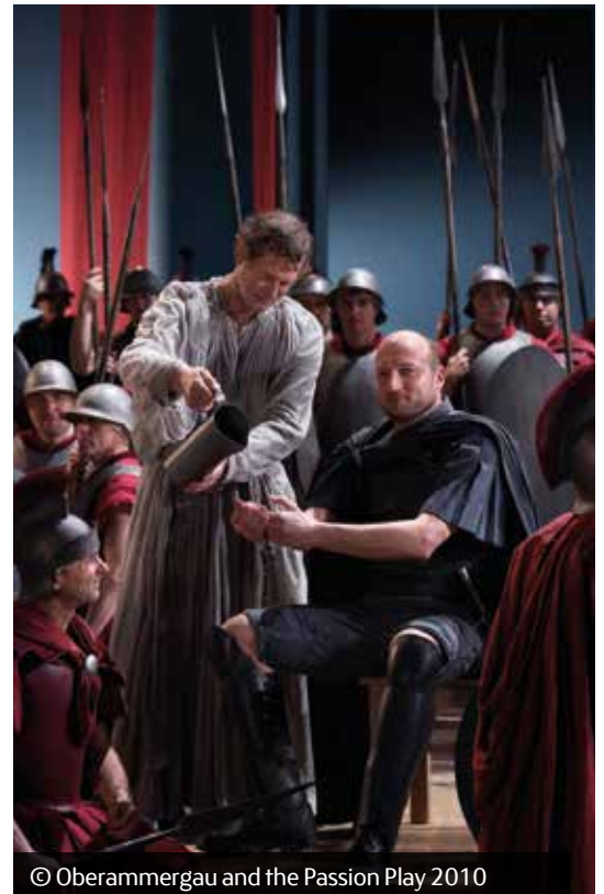
© Oberammergau and the Passion Play 2010

This is a provisional itinerary. Tour details currently subject to change.