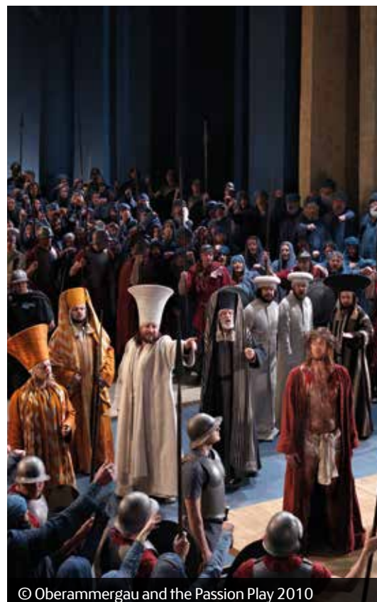
© Oberammergau and the Passion Play 2010

This is a provisional itinerary. Tour details currently subject to change.