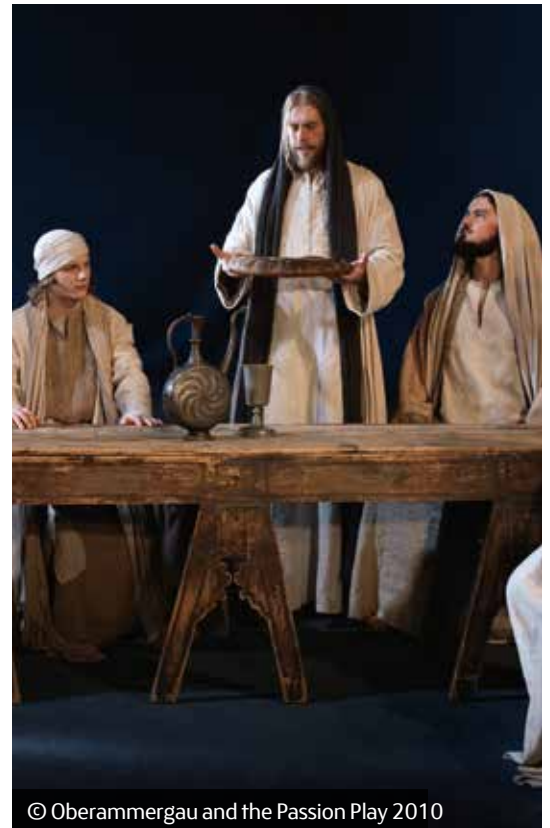
© Oberammergau and the Passion Play 2010

This is a provisional itinerary. Tour details currently subject to change.