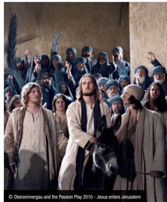
© Oberammergau and the Passion Play 2010 - Jesus enters Jerusalem

DAY 13 Munich - Tour Ends This morning your tour comes to a close. (B)