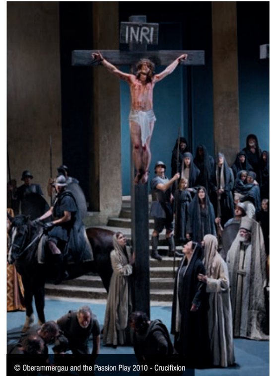
© Oberammergau and the Passion Play 2010 - Crucifixion

DAY 12 Munich - Tour Ends Your tour comes to a close today. (B)