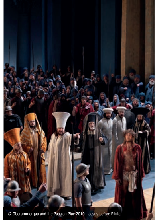
© Oberammergau and the Passion Play 2010 - Jesus before Pilate

DAY 10 Munich - Tour Ends Your tour ends today in Munich. (B)