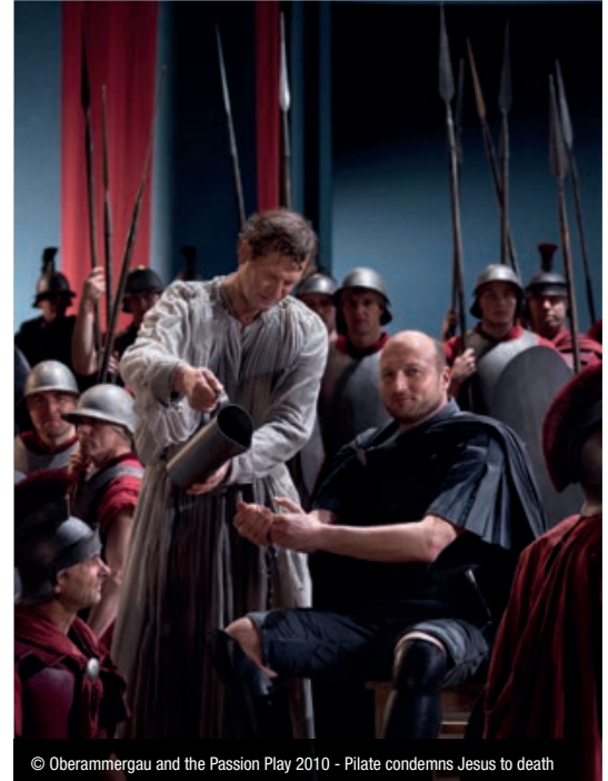
© Oberammergau and the Passion Play 2010 - Pilate condemns Jesus to death

DAY 11 Munich - Tour Ends Your tour comes to a close today. (B)