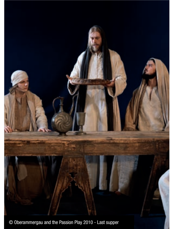
© Oberammergau and the Passion Play 2010 - Last supper

DAY 13 Lucerne - Tour Ends Your tour comes to a close in Lucerne. (B)