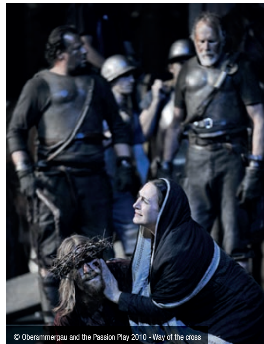
© Oberammergau and the Passion Play 2010 - Way of the cross

DAY 11 Munich - Tour Ends Your tour comes to a close today. (B)