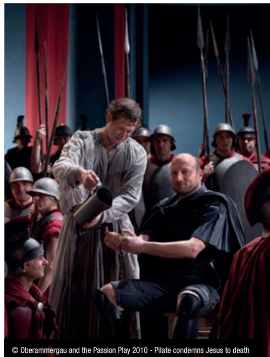
© Oberammergau and the Passion Play 2010 - Pilate condemns Jesus to death

DAY 11 Munich - Tour Ends Your tour comes to a close today. (B)