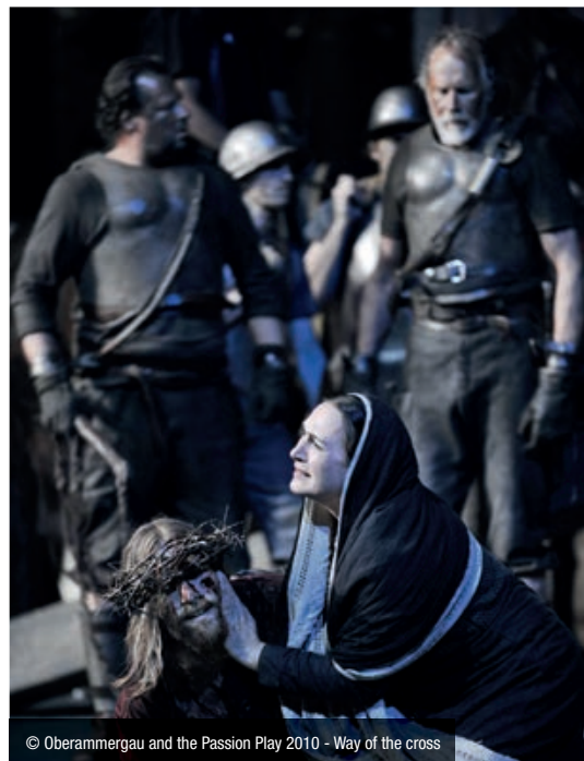
© Oberammergau and the Passion Play 2010 - Way of the cross

DAY 11 Munich - Tour Ends Your tour comes to a close today. (B)