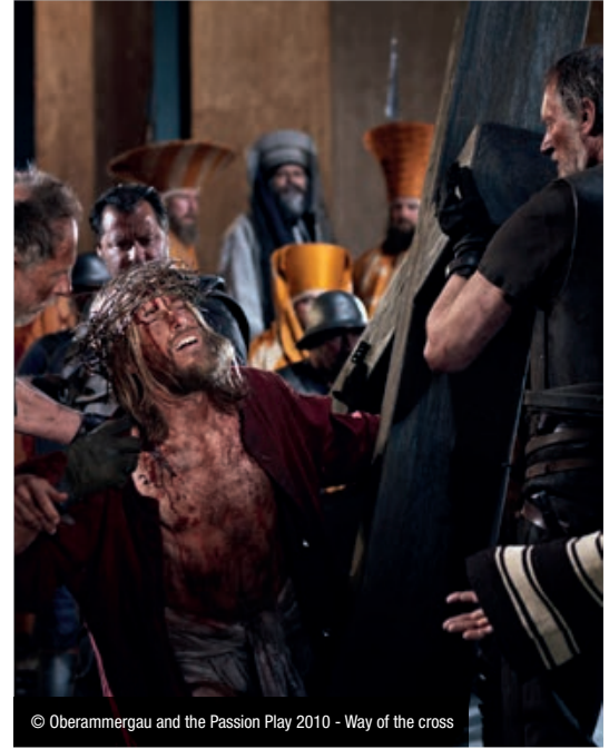
© Oberammergau and the Passion Play 2010 - Way of the cross

DAY 10 Munich - Tour Ends Your tour comes to a close today. (B)