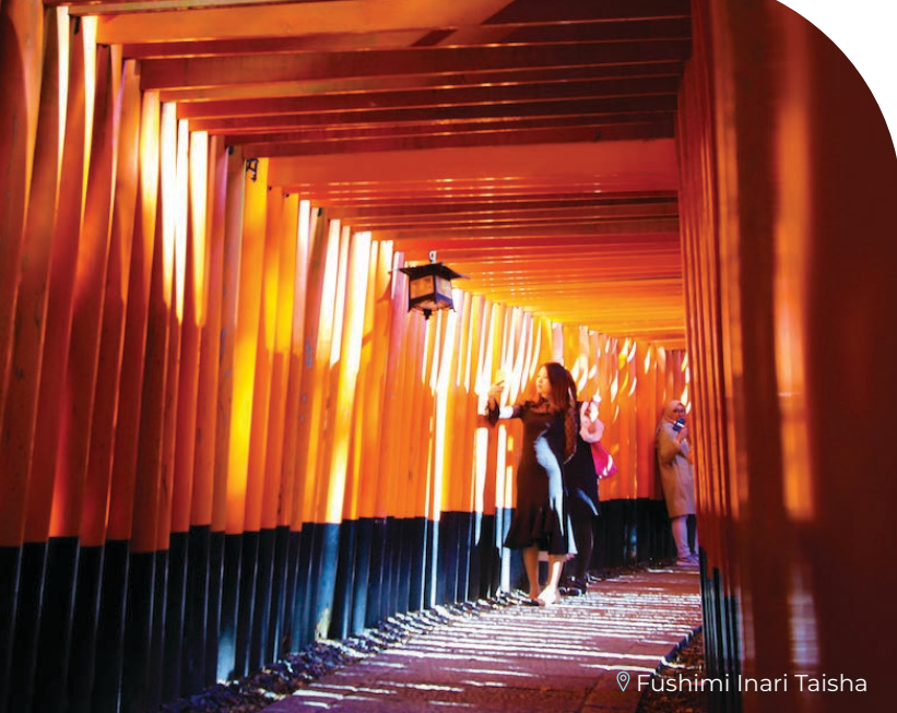
📍 Fushimi Inari Taisha