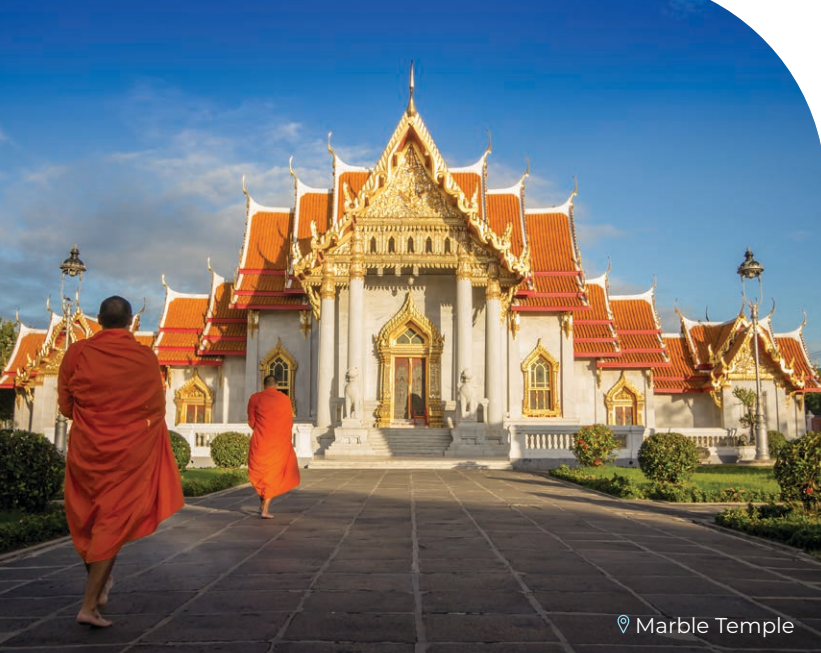
📍 Marble Temple