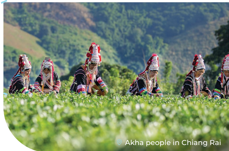
Akha people in Chiang Rai