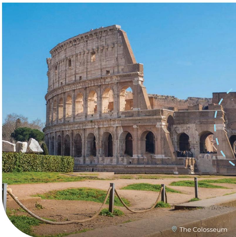
📍 The Colosseum