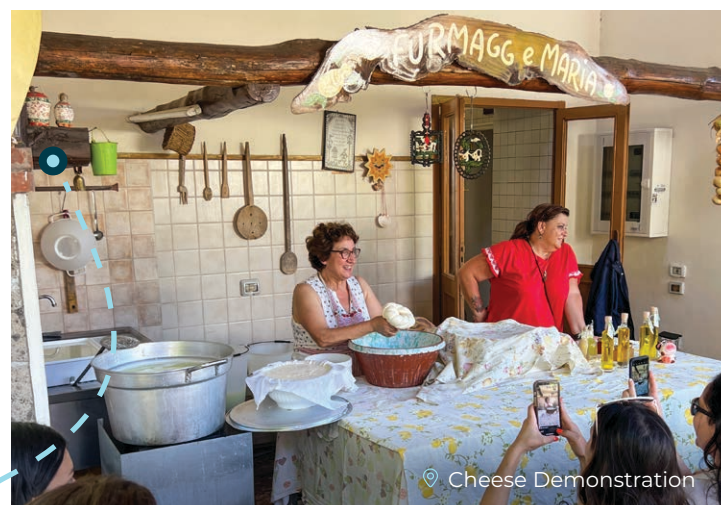
📍 Cheese Demonstration