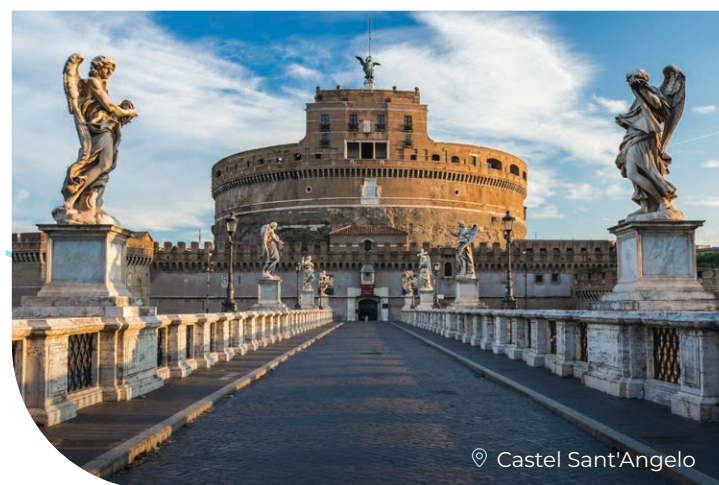
📍 Castel Sant'Angelo