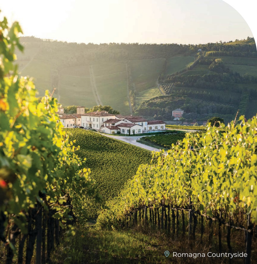
📍 Romagna Countryside