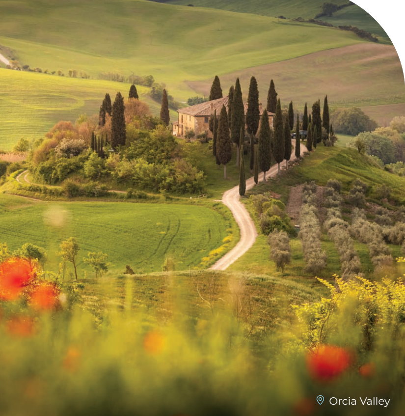
📍 Orcia Valley