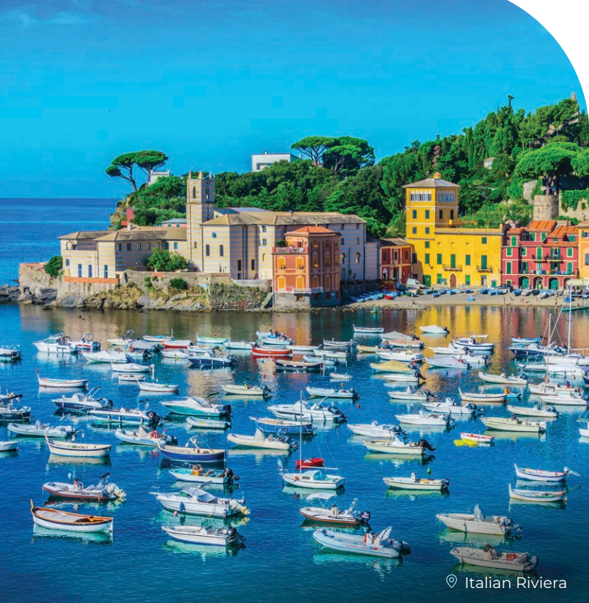
📍 Italian Riviera