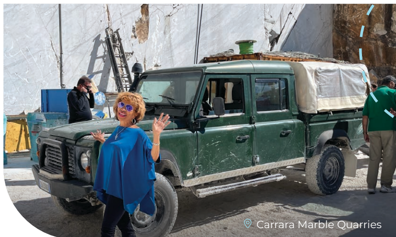
Carrara Marble Quarries