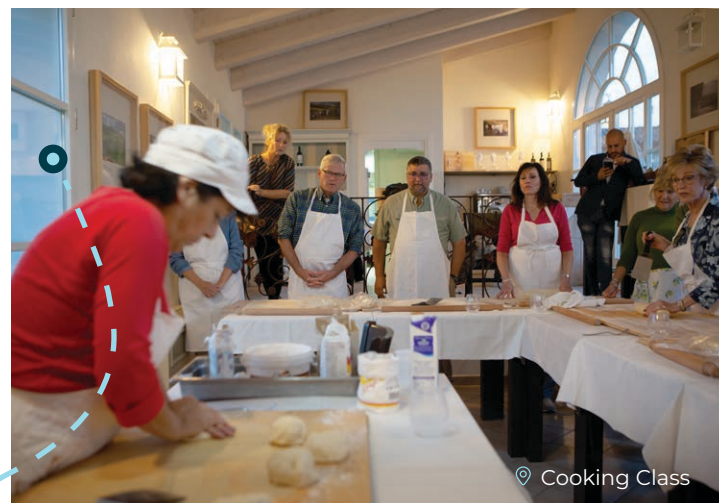
📍 Cooking Class

Accommodation: Ponte Sisto Hotel or UNAHOTELS Trastevere, Rome