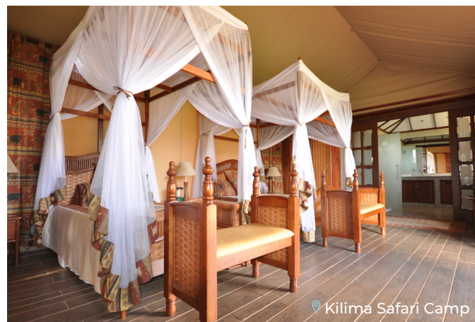
Kilima Safari Camp

Rethink your perspective about camping. Did you know that tented camps can have cozy beds, permanent roofs, and private bathrooms? And while you're among the action, perimeter fencing keeps animals away from your front door.