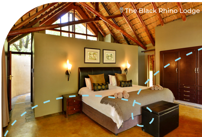
The Black Rhino Lodge