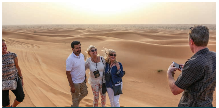
📍 Sahara Desert, Morocco