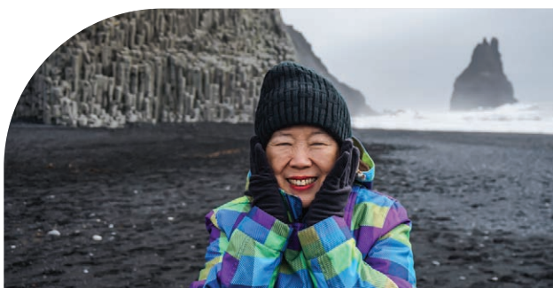
📍 Black Sand Beach, Iceland

We're not just taking you on a tour, we're making it a travel experience you'll never forget. What does that mean for you? More iconic must-see sights and more cultural immersion selected by our experts. More meals at local restaurants, and more authentic dining experiences. 4-star and above accommodations, strategically selected to capture the destination.