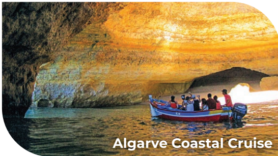
Algarve Coastal Cruise

Many tours offer optional excursions that give your travellers flexibility and a different perspective of the destination. Help your travellers make the most of their tour.