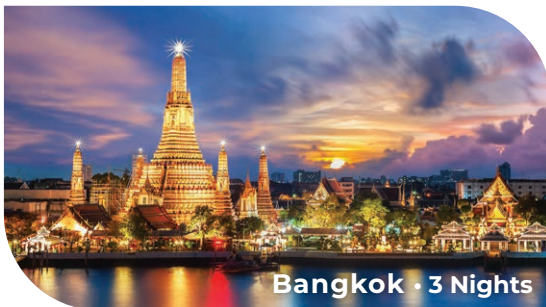
Bangkok • 3 Nights

Our tour extensions compliment so many tours perfectly. These shorter excursions, added before or after a tour, are the best way to add even more memories to a trip.