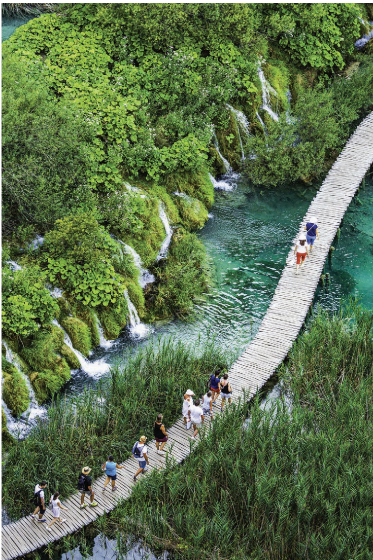
📍 Plitvice Lakes, Croatia