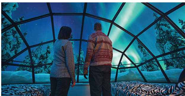
📍 Kakslauttanen Arctic Resort, Finland

Our cultural experiences, hand-crafted by our experts, allow you to truly get to know both the destination and the people who call it home.