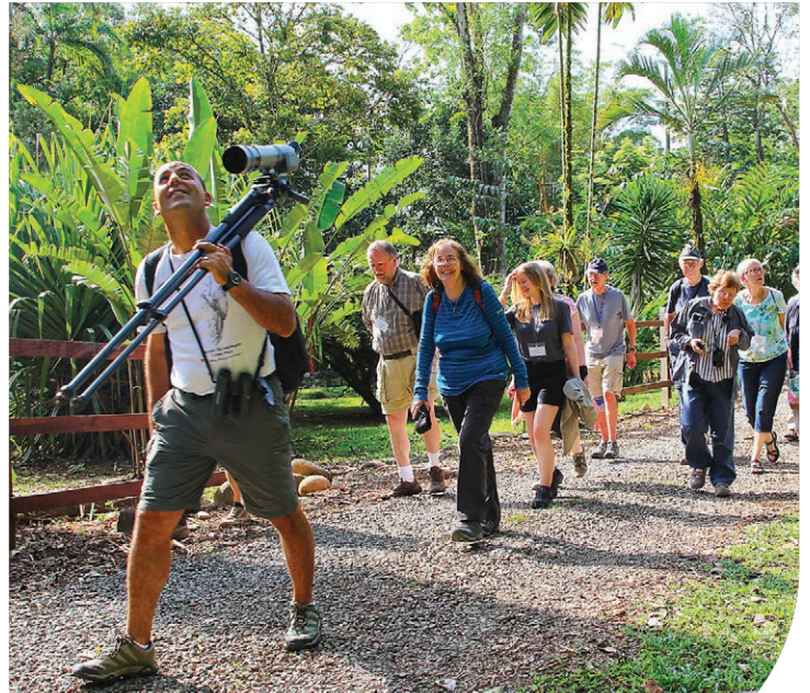
📍 Monteverde, Costa Rica