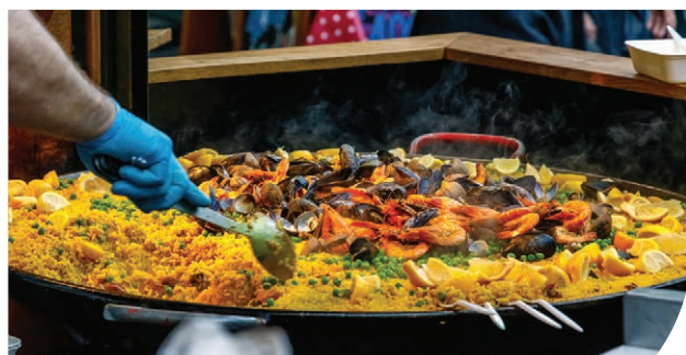
📍 Paella Demonstration, Spain

We carefully choose each 4-star hotel to enrich your experience, making sure they're located in strategically selected spots that capture the destination.