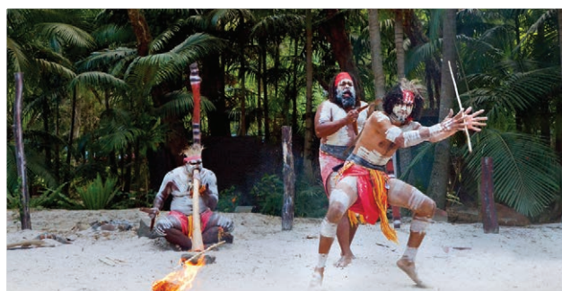
📍 Powhiri Ceremony, New Zealand

They're called "must-sees" for a reason. Our carefully crafted itineraries include those iconic, can't-miss sights for each of our incredible destinations.