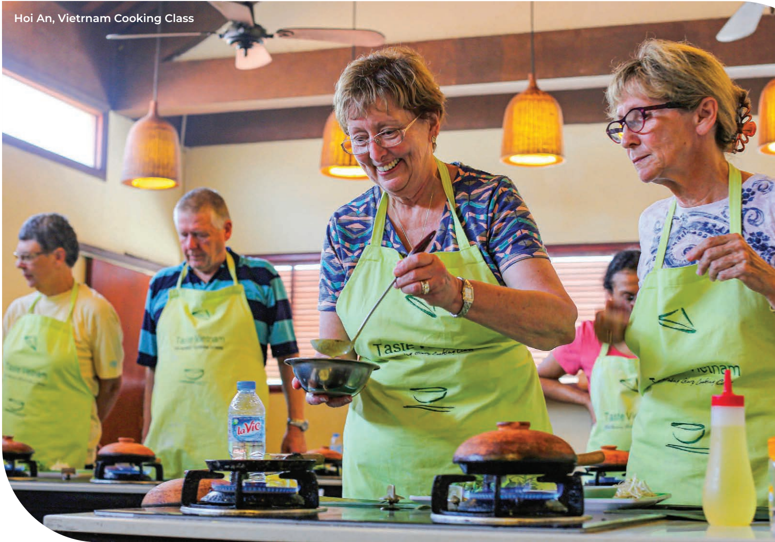
Hoi An, Vietnam Cooking Class