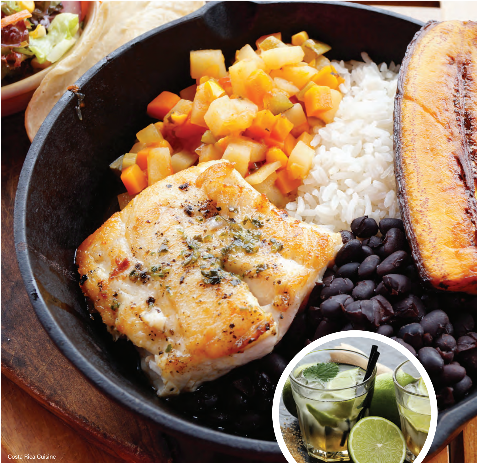
Costa Rica Cuisine