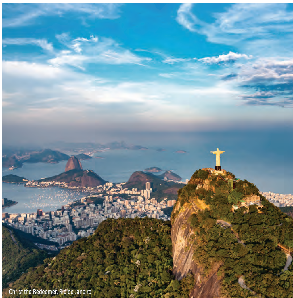
Christ the Redeemer, Rio de Janeiro

Savour South America as you journey from Argentina's lively Buenos Aires to Brazil's beautiful Iguazu Falls and marvellous Rio de Janeiro.