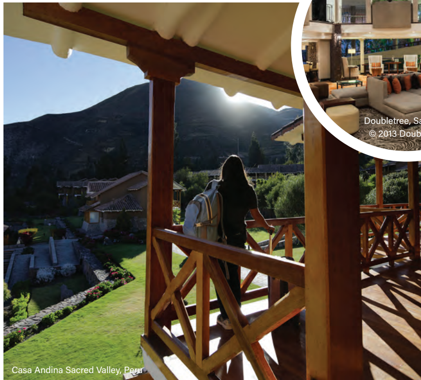
Casa Andina Sacred Valley, Peru