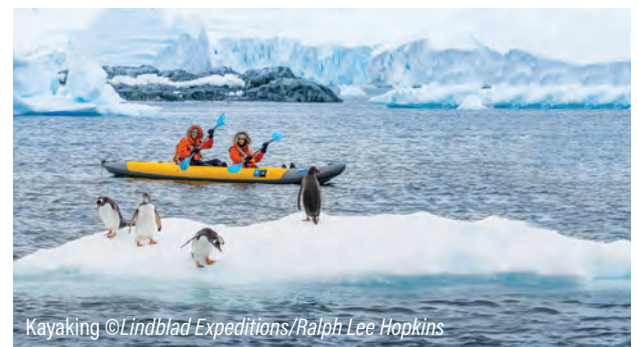
Kayaking

mountains for over five million square miles. The ethereal beauty and immense scale of the continent is like nowhere else on the planet. (B, L, D)