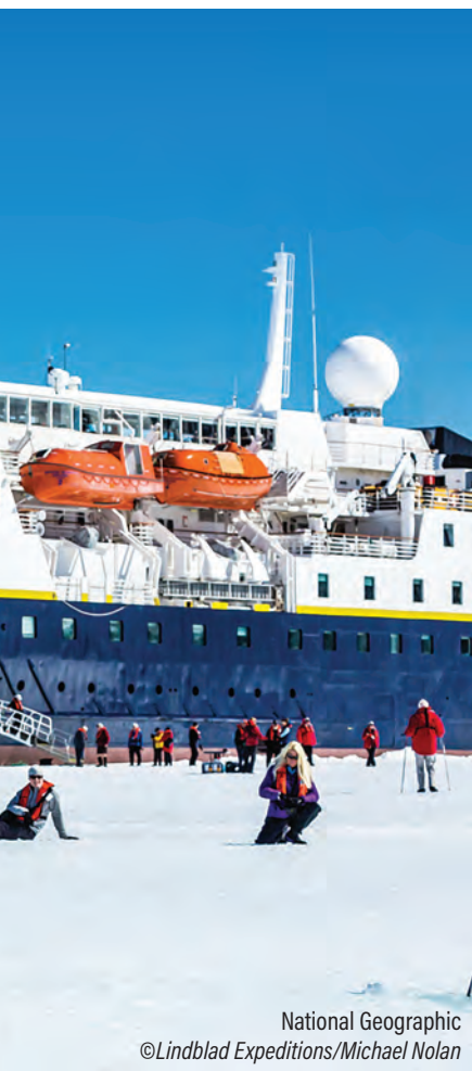
National Geographic