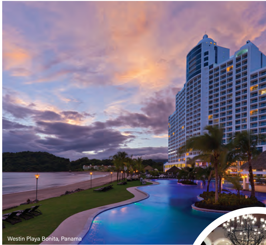
Westin Playa Bonita, Panama