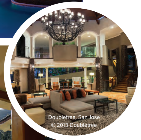
Doubletree, San Jose