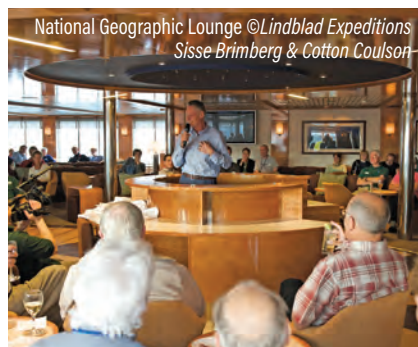
National Geographic Lounge