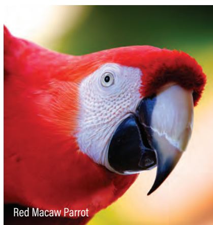
Red Macaw Parrot