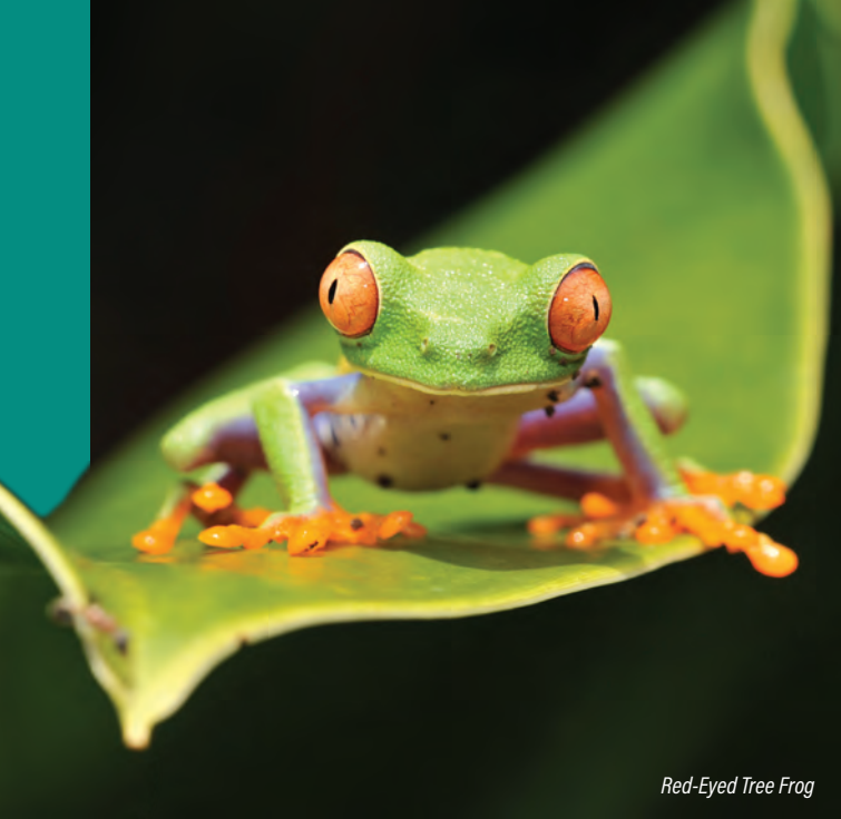
Red-Eyed Tree Frog