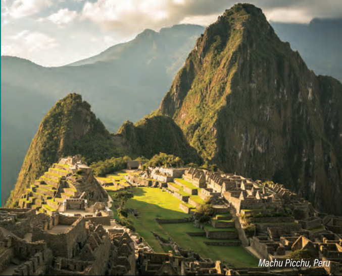
Machu Picchu, Peru